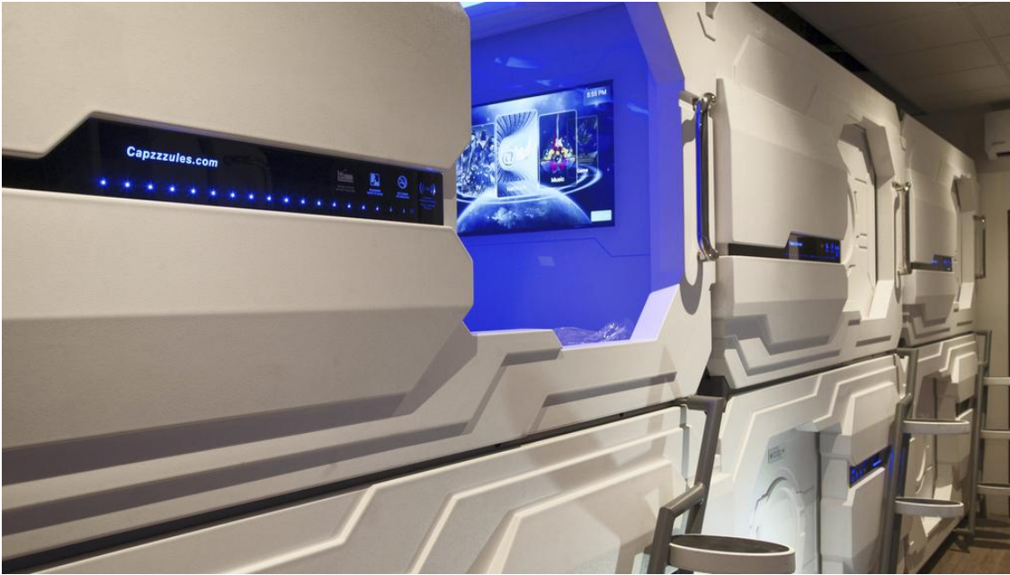
The izZzleep Hotel 'room' is a 1.8-metre by 91cm-high box. I'm in a hotel room, but I'm not writing this Postcard from a desk or even from the edge of my bed.

I can't stare out the window, hoping pertinent things to write about will come to mind. That's because this izZzleep Hotel 'room' is a 1.8 metres-long by 91 centimetres-high box, one of 40 capsules that have opened as a concept hotel in Mexico City's Benito Juárez International Airport.