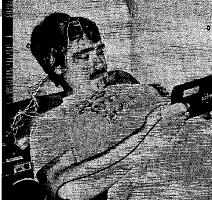
A B-747 crew member contributes to NASA Ames' fatigue research by inputting data into an interactive reporting log while reclining on a bunk in the aircraft's rest area. Attachments collect data on brain and eye movement activity as well as the oxygen saturation level.

NTSB collaborations. The NTSB has examined a variety of human performance factors in its many investigative and safety activities and made related recommenda-